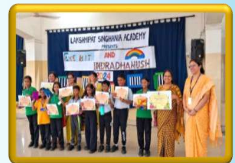
Indradhanush -organized by Lakshmiapat Singhania Academy