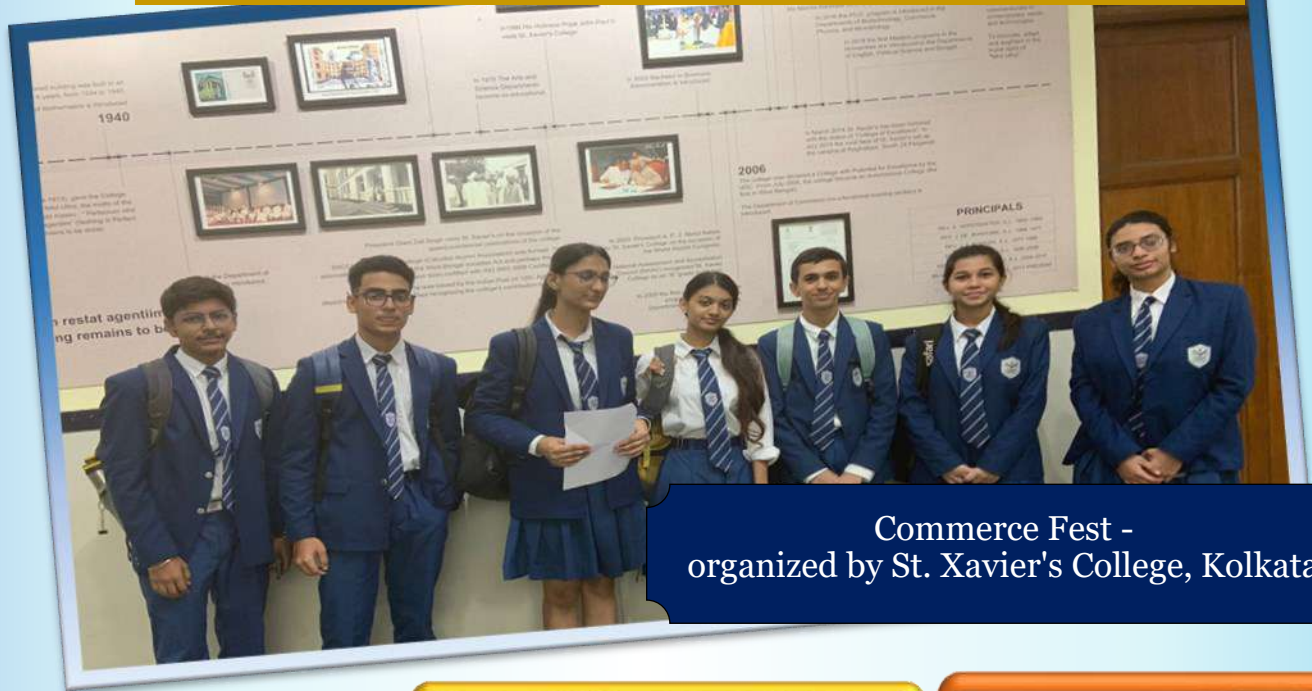
Commerce Fest - organized by St. Xavier's College, Kolkata

Our students excelled in multiple inter-school events, displaying exceptional creativity, intellect and collaboration. From tech fests, science competitions to literary meets, they earned top honors across diverse categories. These remarkable achievements reflect not only their individual talents but also our school's dedication towards nurturing well-rounded and holistic learners. Here are some of the highlights of their stellar performances, as they made us proud in every platform they participated in.