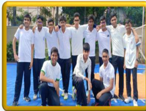
Sanglaap – a Literary Meet hosted by The Heritage School.

Our students excelled in multiple inter-school events, displaying exceptional creativity, intellect and collaboration. From tech fests, science competitions to literary meets, they earned top honors across diverse categories. These remarkable achievements reflect not only their individual talents but also our school's dedication towards nurturing well-rounded and holistic learners. Here are some of the highlights of their stellar performances, as they made us proud in every platform they participated in.