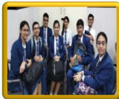
Morpheus 2024 - hosted by South City International School