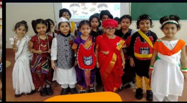
All hands on deck!

Far up in the deep blue sky, Great white clouds are floating by; All the world is dressed in green; Many happy birds are seen, Roses bright and sunshine clear Show that our lovely Monsoon is here.